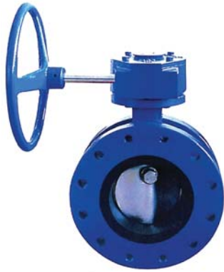
Flange x Flange